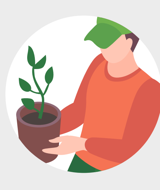
A helping hand